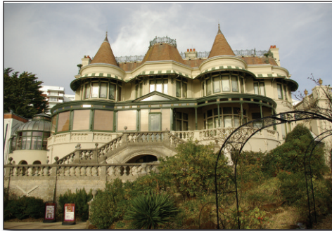
Russell-Cotes Art Gallery & Museum.