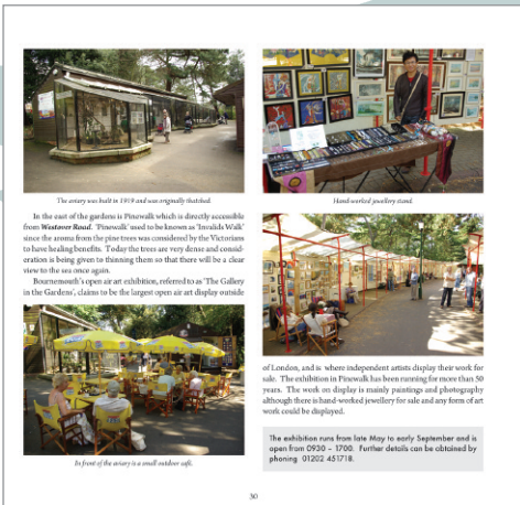
Example of a double-page spread.