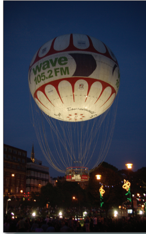
The Bournemouth Eye.