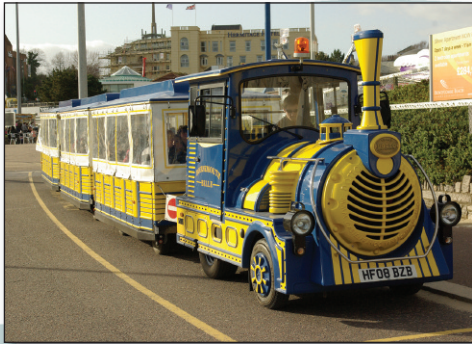
The Land Train.