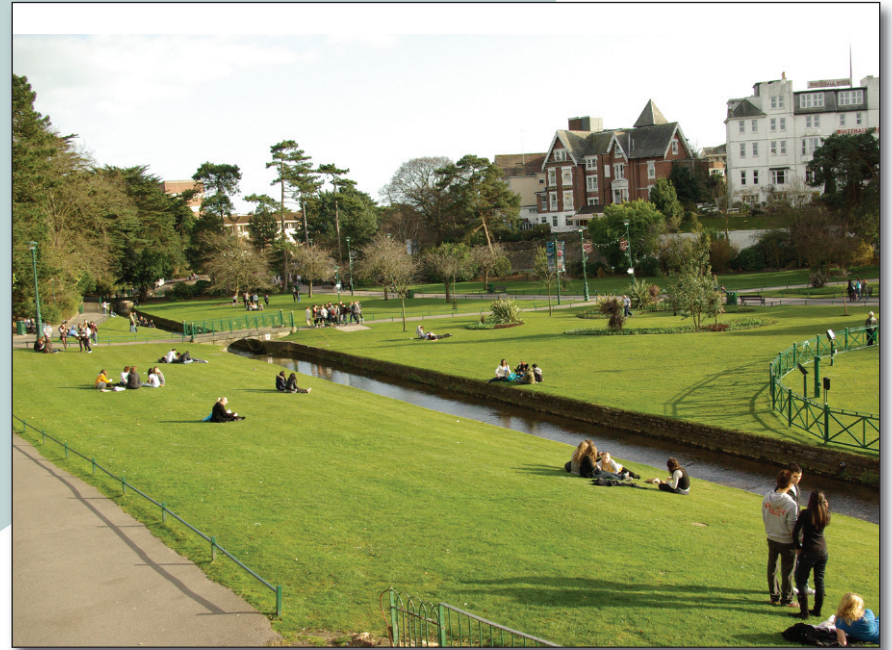
The Lower Gardens.